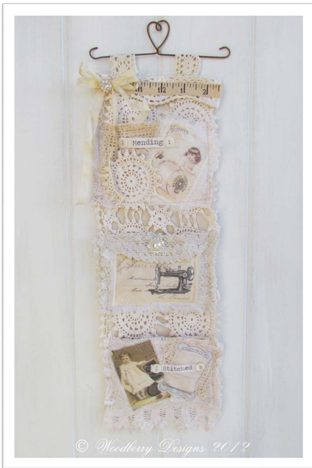
Vintage Sewing Storage

© 2012 Kerryanne English, Woodberry Designs